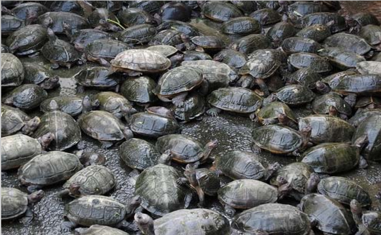
Island of Turtles